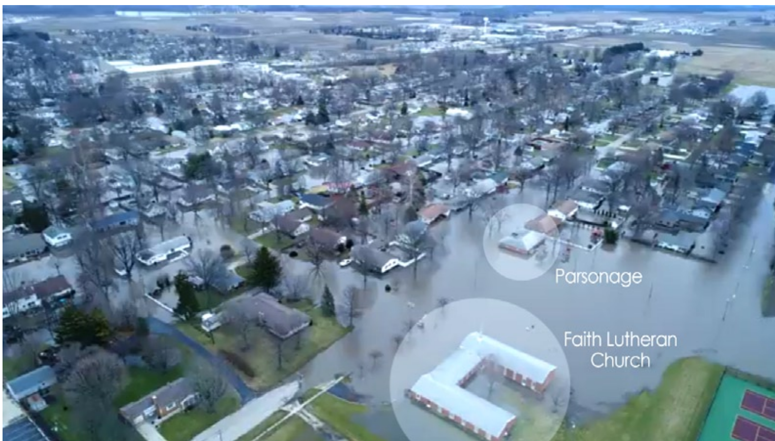
The original screenshot was taken from Robert Devine's YouTube page and later edited to highlight the church and parsonage locations. The link to the YouTube video is https://youtu.be/wBgAnmJup-4 .