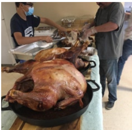
A local farmer supplies the church with 60–70-pound turkeys for the Thanksgiving meal.

This year because of the virus, we held our meal as a takeout event. This proved to be very effective and much less stressful on our faithful volunteers. Recipients simply pulled into the parking lot and someone would go to their vehicle and see how many takeaway trays they needed. In each bag, we included with the food a card with a brief gospel message. We estimate to have sent 160 meals out the door. We also deliver