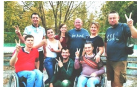
God's Hidden Treasures is one of the ministries supported by Women of L.I.F.E.