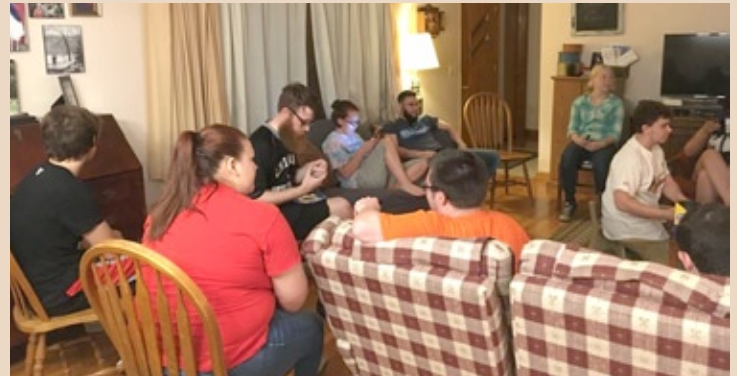
Kickoff Meeting on June 1