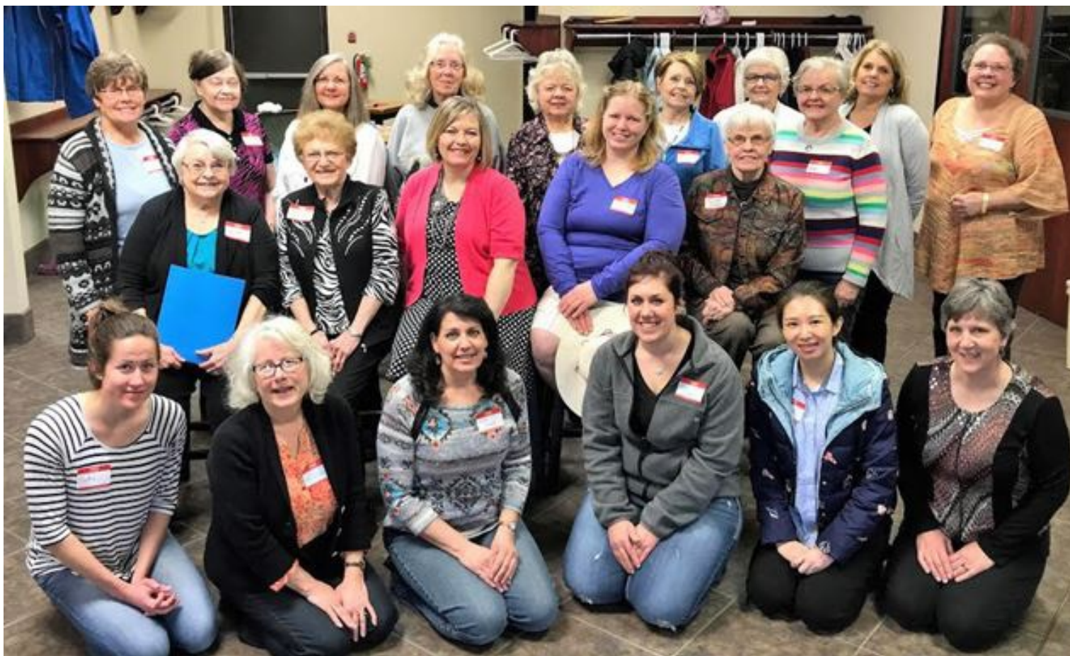
A total of 25 ladies attended Bible Lutheran Church's 2nd annual spring/summer Women's Retreat.