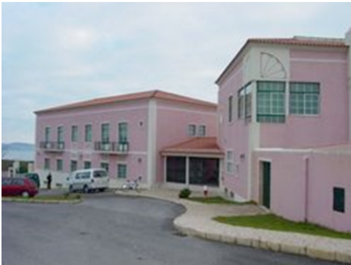
Greater Lisbon Christian Academy

Facebook: Greater Lisbon Christian Academy