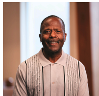
Leroy Speaks Facilities