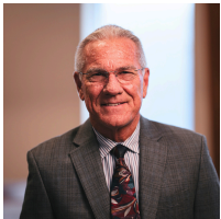
Kirk Huckabone School