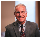
Kirk Huckabone School