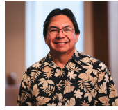
David Banda Outreach