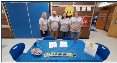
Dodson's Back-to-School Open House

For more information about TGBC's missions projects, contact our church office.