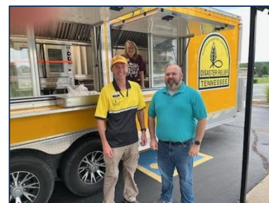
GAs and RAs learned about Disaster Relief at Kids Missions Experience this summer.