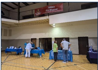
“Judea” – Our Region