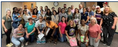
Fall 2024 Tue-Wed-Thu ESL Groups