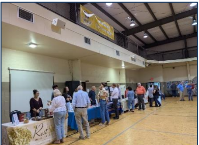
“Jerusalem” – Our Community