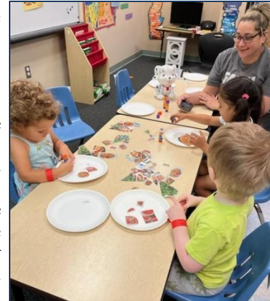
3&4-Year-Old Mission Friends learn about a missionary using a coffee cart to share about Jesus.