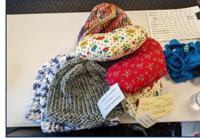
TGBC Craft Ministry