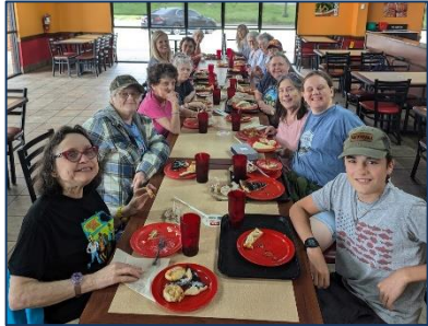
White House Summer Movies & Cici's Pizza