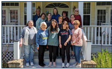
Women on Mission Sisters serving in April at Rest Stop Ministries

Women on Mission is for all women 18 and up. Join us the first Tuesday each month 6:30-8 pm as WoM Sisters create multigenerational bonds where doing life together for His kingdom is our desire as we live out His mission!