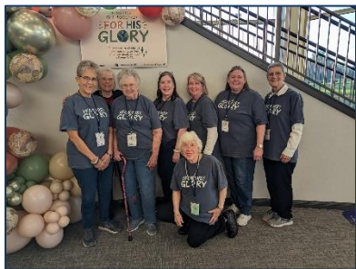
WoM at the April Missions Get-Together at Brentwood Baptist