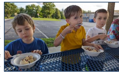
Mission Friends End-of-Year Ice Cream Sundae Party. These boys are now in RAs!