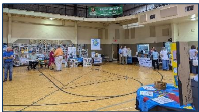
“End of the Earth” – Our World