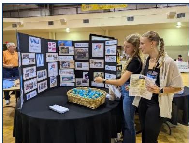
WMU is the umbrella for all age-level missions discipleship: MissionFriends, GA, RA, YoM, WoM