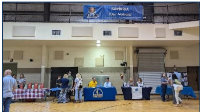
“Samaria” – Our Nation