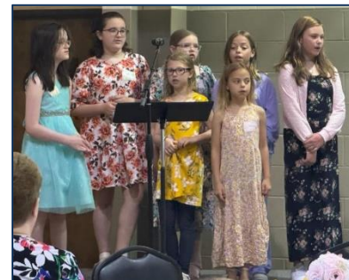
GA Mother-Daughter Tea