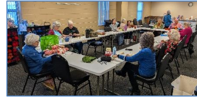
BUSY CRAFTERS making crafts that benefit many ministries!

Women on Mission continue our ongoing missions projects with White House TN Baptist Adult Home in Lebanon. The ladies love our monthly Lunch & Games with them the fourth Monday each month and love the time we spend with them. They were so grateful for our Christmas Party for them in December! Watch the announcements for summer projects in June and July.