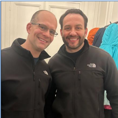
Pray the Lord will raise up more elder-qualified men to serve in Paris.