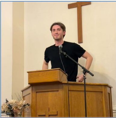
Young graduate students are arriving in droves, searching for hope in the midst of a city that has worn them down.