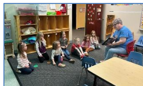
Mission Friends learned about Central Asia...