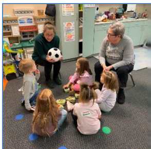
Mission Friends learned about missions in Brazil in their Int'l Mission Study