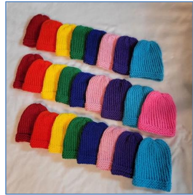
Kid's hats made for kids at Charlotte Park Elementary.