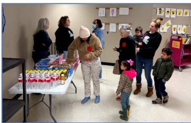
TGBC SS classes donate nutritious snacks for Dodson's Good News Club