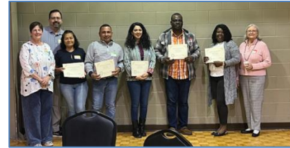
Level 2 and 3 ESL Graduates