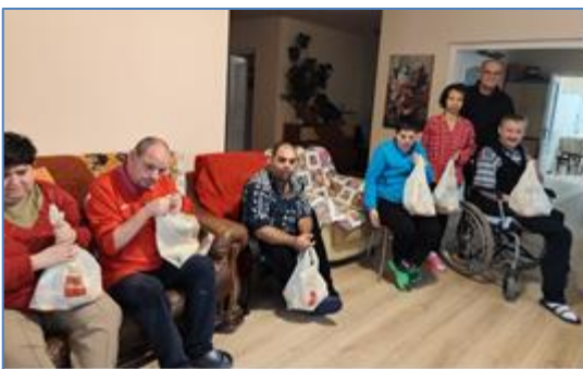
In this picture is a group of handicapped orphans who received Christmas presents. It was a good occasion for a pastor to share the Gospel with them.