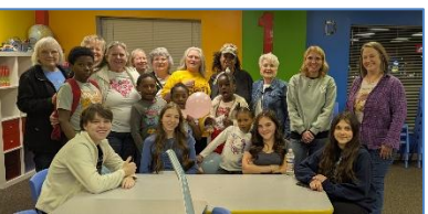
WoM Sisters and several TGBC youth provided a Valentine's Party for the children at Begin Anew Madison .