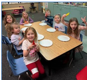
Mission Friends learned about items Israelites offered to build tabernacle