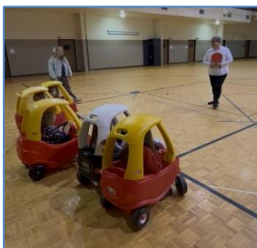
Mission Friends 'driving' like New Yorkers in heavy traffic!