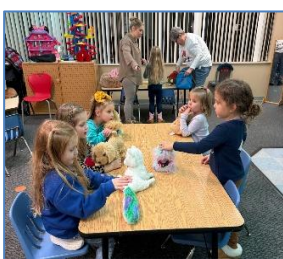
Mission Friends learned about service pets used to minister in NYC.