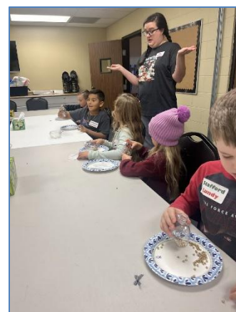
Above photos are all from our International Mission Study on Brazil in December.