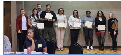
Level Intro and Level 1 ESL Graduates

Thank you for being part of what God is doing through ESL Tulip Grove.