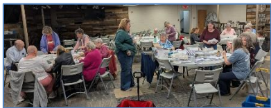
WoM helping with Trinity Hope Haitian Feeding Program fall mailout