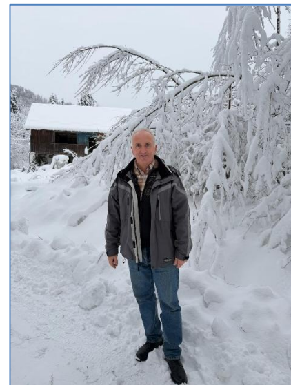
A pastor walking in a heavy snow to a morning church service.

A group of Christians in a house are together to praise our awesome God. This is very common in Romania.