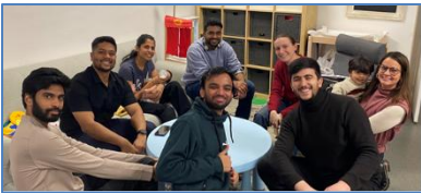
Grace Fellowship International Church in Paris recently baptized three new believers.

For the complete NBA article, go to nashvillebaptists.com/a-new-beginning-at-the-bullington-ministry-center