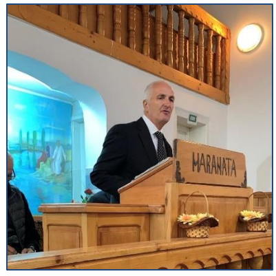
A Romanian pastor preaching