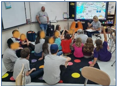
Dodson's Good News Club

Current PCC needs: Size 6 diapers Diaper rash cream Baby shampoo Baby wipes