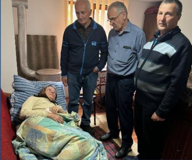
A sick elderly bedridden lady visited at her home by two pastors