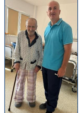
A sick elderly man visited at the hospital