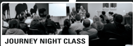
JOURNEY NIGHT CLASS

JANUARY FEBRUARY MARCH APRIL MAY JUNE JULY AUGUST SEPTEMBER OCTOBER NOVEMBER DECEMBER