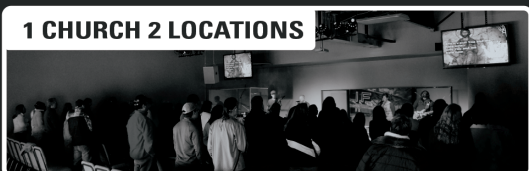
1 CHURCH 2 LOCATIONS

IN MARCH WE CELEBRATED THE ANNIVERSARY OF BEING ONE CHURCH WITH TWO LOCATIONS.