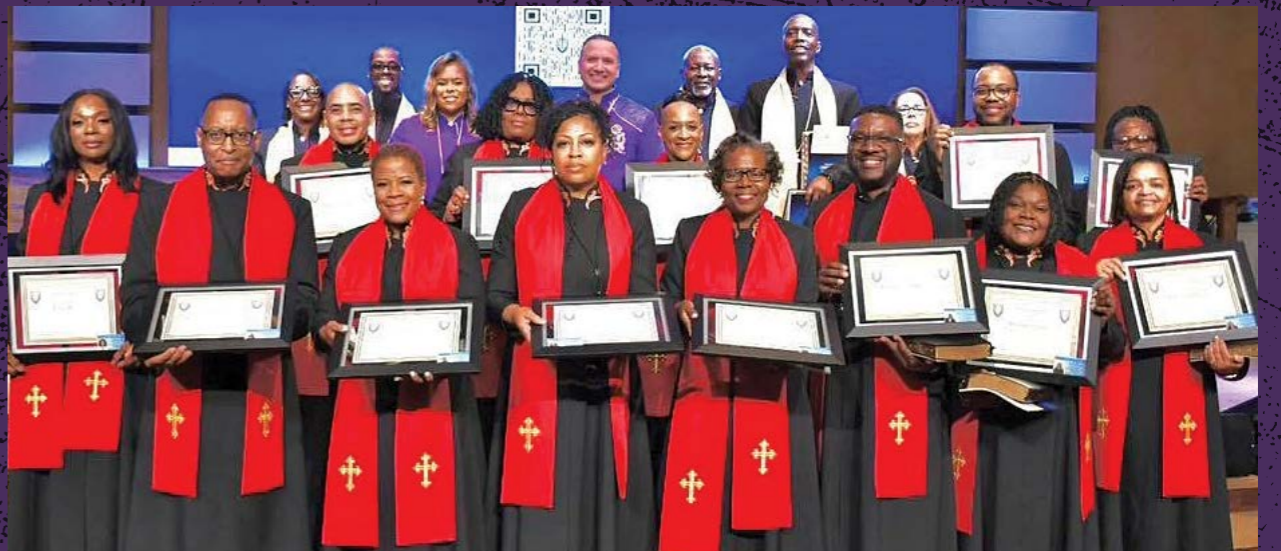
Newly Licensed Ministers