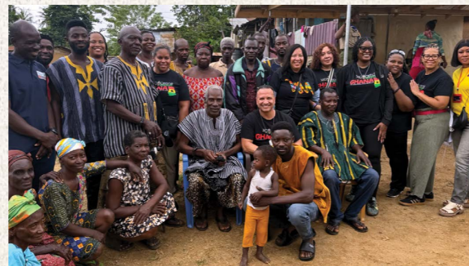
2025 Ghana Trip