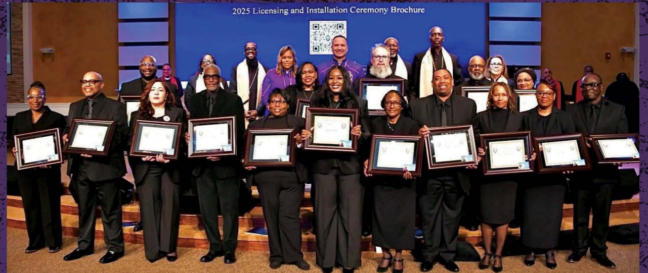
Newly Installed Deacons