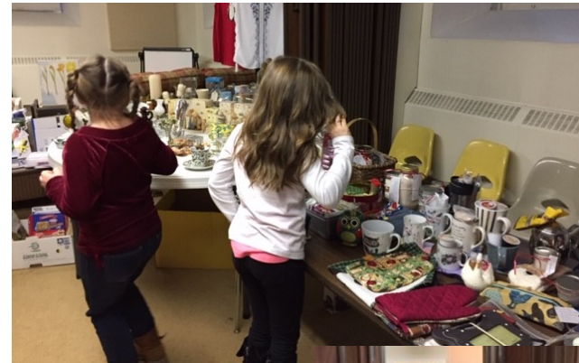
Pictured left and below: Logos children shopping for their parents/guardians for Christmas