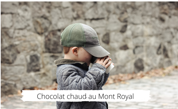
Chocolat chaud au Mont Royal