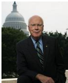
Patrick Leahy President Pro Tempore Assumed office: January, 2021