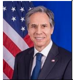
Antony Blinken Secretary of State