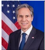
Antony Blinken Secretary of State