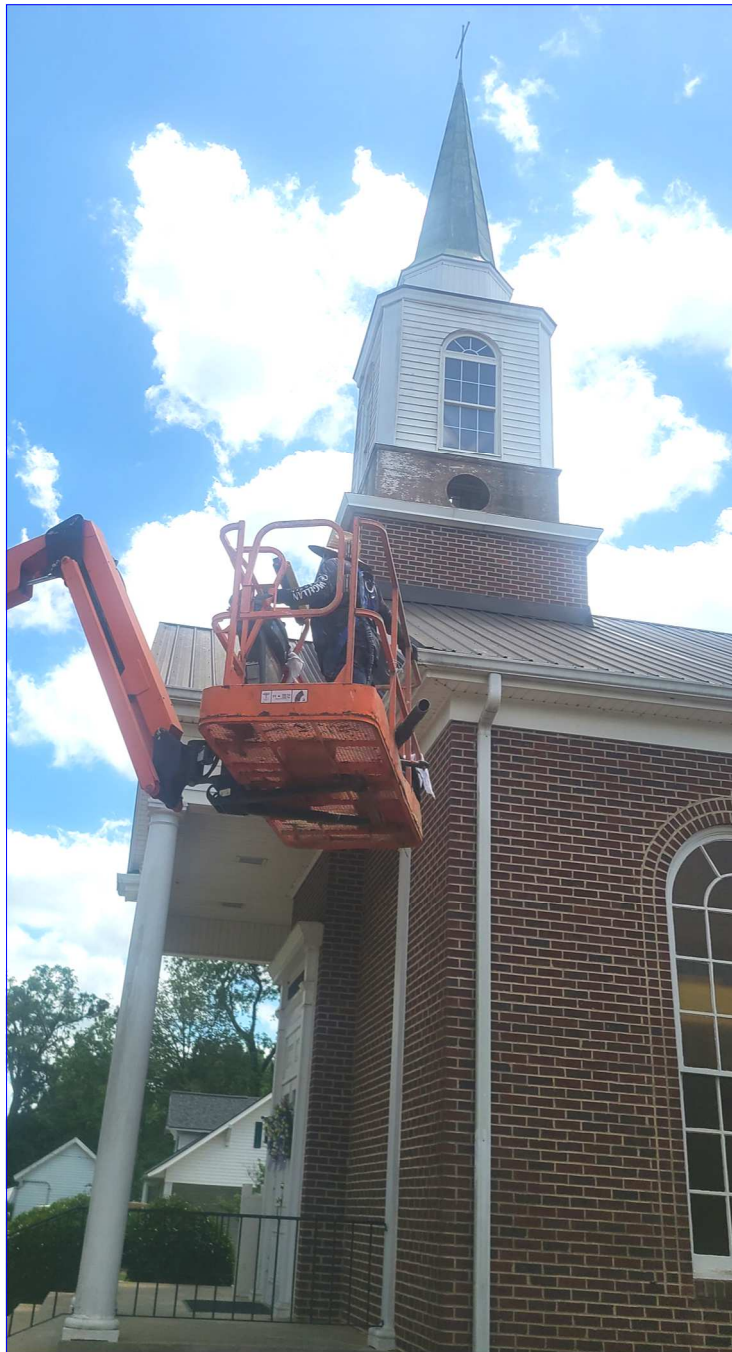
Looking up: Bone Dry Roofing was on the scene recently making some much-needed repairs to the steeple.