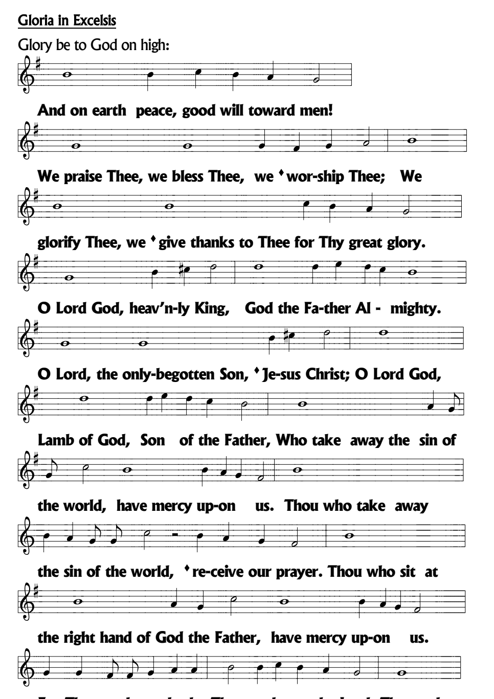
For Thou on-ly are ho-ly; Thou on-ly are the Lord. Thou only