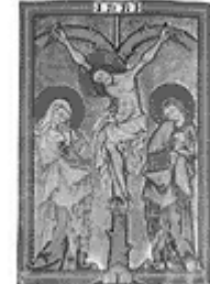
Vacation Bible School For Devoted Parents