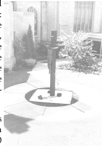
Zion's 90th Anniversary, 1972