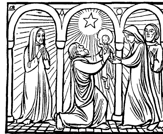
Our Lord with Simeon and Anna in His Presentation in the Temple

Arise, shine; for thy light is come, and the glory of the Lord is risen upon thee.