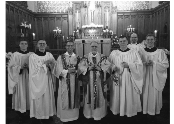
The Resurrection of Our Lord 2015