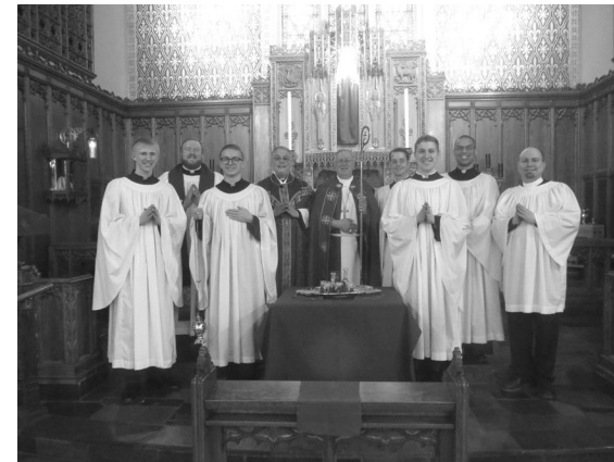
Chrism Mass 2015

Thanks to those who helped prepare and serve at the Masses for Holy Week and Easter.