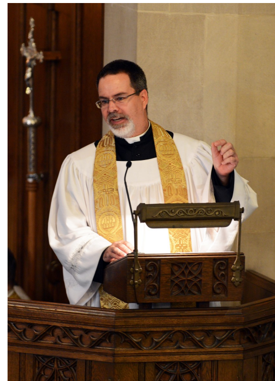
Holy Mass: The Commemoration of St. Wenceslas, Martyr