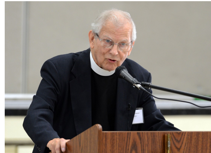
Liturgical Renewal in Missouri