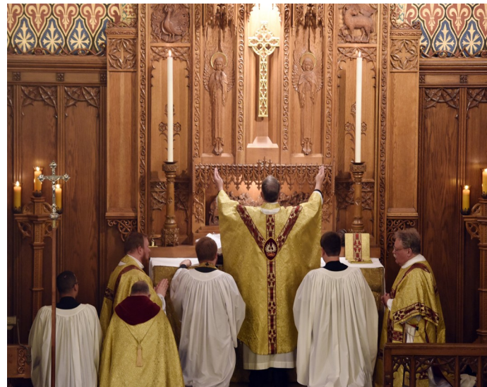
Holy Mass: The Commemoration of St. Wenceslas, Martyr