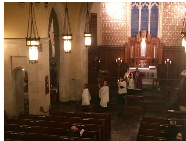
The altar prepared for Palmarum.