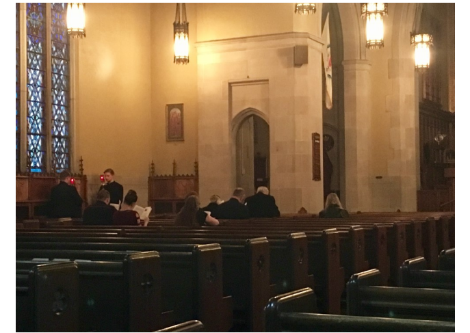
The Stations of the Cross, prayed on Good Friday.