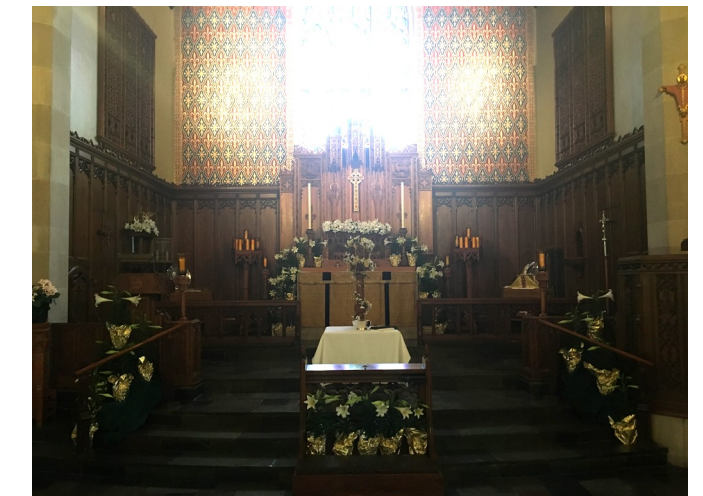
The Mass The altar prepared for Easter Sunday.